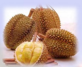
Durian. the most famous fruit in Nonthaburi